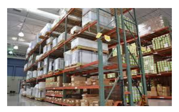
Fig.4. Materials in stores