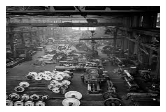
Fig.2. Materials waiting in machine shop

There are two different forms of waiting. One when the raw materials are not available at the required time both man and machines wait for the arrival of the materials. The second form is when the materials are available but the machines got breakdown, or the man is absent then the materials wait for the machines to get ready or for the available of man.