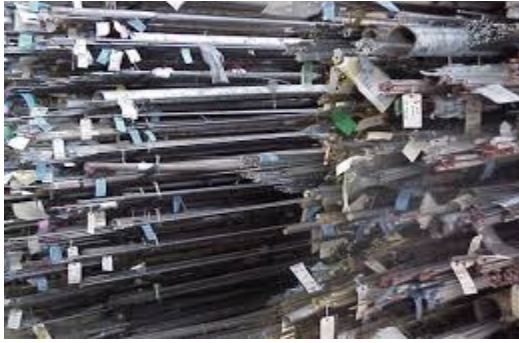
Fig.1. material in stock yard

Transport of materials is considered as one of the non vale added activity. It also damages the materials if it not safely handled, so long and unnecessary transport of materials should be avoided. This can be avoided by placing machines closer to each other. The raw materials are to be off loaded in and stored in a specified area. If there is not enough space at this area then the goods are offloaded and stacked at the available areas around the building. Sometimes this area is too far from the usage area. This results in damage of the materials due to improper storage of materials. These materials are transported to the required area by forklifts. The materials travel long distance if they are stored far away from the stock yard.