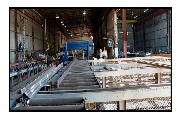
Fig.5. New material handling system